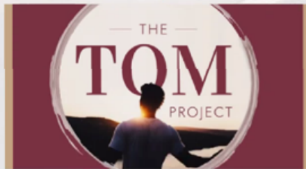
FSU students advocate for cardiovascular health resources following the passing of 22-year-old Tom Idowu, who suffered a heart attack.

On April 29, 2020, FSU student Tom Idowu passed away from sudden cardiac arrest. Bearing this tragedy, Florida State students recognized the need for cardiovascular health resources and equipment on campus. In the spring of 2021, COGS proudly donated $49,000 to purchase 28 new AEDs, contributing to a 38% increase in AED accessibility on campus. Funding contributions made up a total of $100,000 aimed at paying for expenses and equipment replacement for the next 30 years. COGS is working to support the next steps of this movement, as student advocates seek to fund available CPR and AED training on campus. For more information, please contact Chris Hagemeyer at COGSSpeaker@admin.fsu.edu.