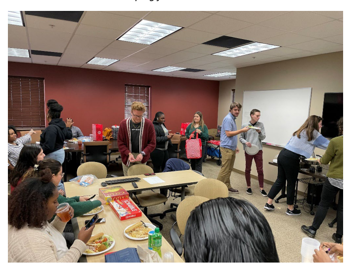
"I always have an amazing experience at Third Floor Thursday! I am immediately met with welcoming and sincere energy from the moment I walk into the room."

*Quotes pulled from anonymous Qualtrics surveys